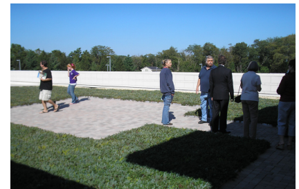
Green roof accessible from library