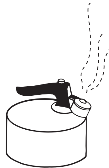
Steam from teapot