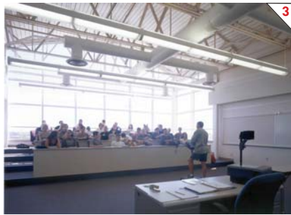
Typical Team Resource Center