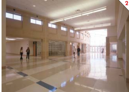
Main Entrance Corridor