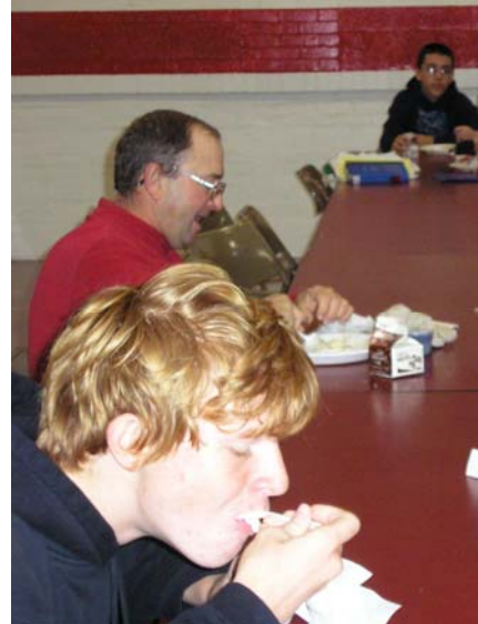
Faculty in background enjoying school breakfast

School breakfast participation is growing since its launch earlier this fall. The usual customer is a male aged 14–18. More boys choose to eat breakfast than girls, with a ratio of approximately 8:1. A nice surprise is that many faculty members choose to eat school breakfast as well enjoying the company of the students in the cafeteria.