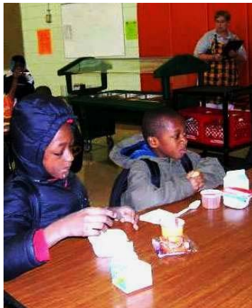
Oakdale Elementary School students begin their school day

Normal Community West High School—Normal Oakdale Elementary School—Normal *Parkside Elementary School—Normal Pepper Ridge Elementary School—Bloomington Sugar Creek Elementary School—Normal *Unity Community Center—Normal (summer only)