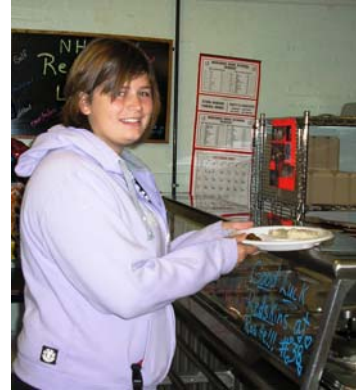
First in line for breakfast

*The other two Illinois schools receiving the got breakfast? ® grant were Namaste Charter School in Chicago and Maple Elementary School in Loves Park.