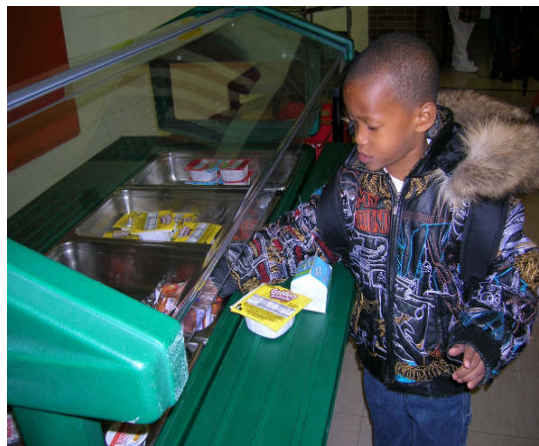
A student makes his breakfast selections at Oakdale Elementary School

Most recently, McLean CUSD 5 added their two high schools to this growing list of SBP schools. Powers states it was relatively easy to add the SBP at the high schools since they already served an a la carte breakfast. It was just a