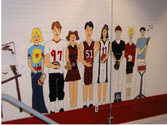
Mural on gymnasium/cafeteria wall