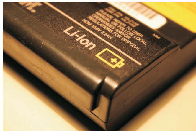
FIGURE 3. When you replace computer batteries, printer ink, copier toner, and other consumable products, always use the correct replacement parts.

Food, liquids, and smoke are all potential hazards for electronics. Food particles can slip into the keyboard and disperse into the electric circuitry. Meanwhile, liquids can spill and damage your computer and components. Smoke can layer and “gum up” internal microprocessor circuitry and cause malfunctions. Also, smoke damage to computer equipment may negate the warranty.