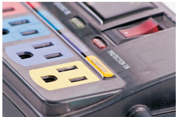
FIGURE 2. Surge protectors protect electronic equipment from some voltage spikes.

Equipment should be plugged in whenever possible to maintain a battery charge. It is wise to plug your computer into a surge protector rather than directly into an electrical outlet. Surge protectors are devices that protect electronic equipment from being damaged by voltage spikes during storms or power outages. However, during a storm when lightning strikes nearby, it is best to unplug electronics, as many surge protectors may not protect against intense lightning strikes.