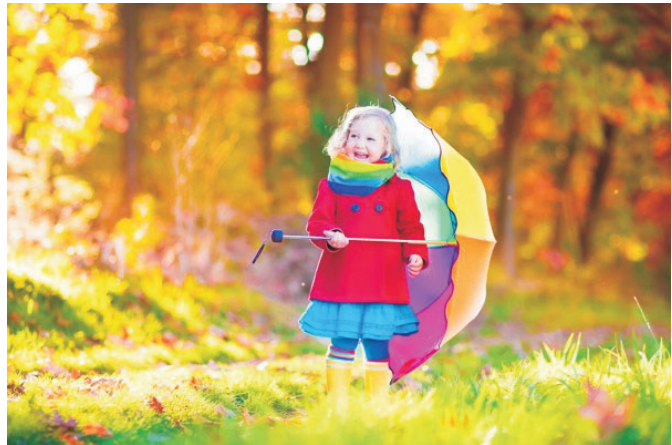
FIGURE 1. Warm colors are considered vivid and energetic and are associated with the sun.

Each color on the color wheel can be altered in three ways: tinting, shading, and toning. Tint (a pastel) is a color created by adding white to a hue. It is a lighter version of the hue. A tint is a color that produces a soft and soothing color scheme; it is sometimes referred to as feminine. Shade is a color created by adding black to a hue. It is a darker version of the hue. A shade produces deep and powerful color schemes; it is sometimes referred to as masculine. A shade is typically used as an accent. Tone is a color created by adding grey to a hue. It is a more muted version of the hue. A toned color is pleasing to the eye. It is also complex and subtle. Sometimes tone is referred to as sophisticated.