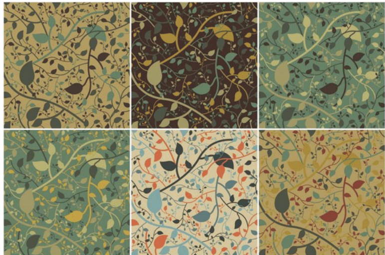
FIGURE 4. Neutral color schemes provide a minimalist approach to decorating and textiles.

Neutral color schemes are color schemes that use the following hues: black, white, grey, silver, and brown. Neutral colors contain equal parts of the three primary colors, and these neutrals have low color saturation (color intensity). Neutral color schemes provide a minimalist approach to decorating and textiles. They are calming and safe. Accenting a neutral color scheme with pops of color (e.g., red) makes the neutral color scheme more interesting. An example of a neutral color scheme is black and white. When a neutral is added to a hue, the value is changed.