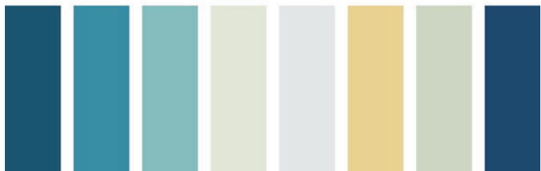
FIGURE 3. This is an example of a color scheme used at an amusement park.