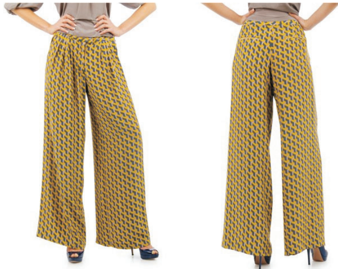
FIGURE 3. Slacks or jeans with a flare at the bottom accentuate the hourglass shape.