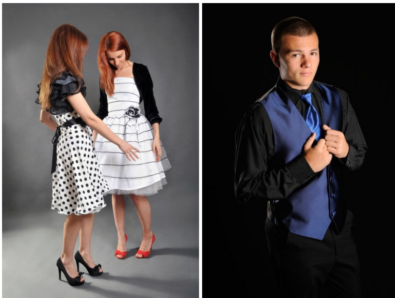
FIGURE 11. Homecoming dance dates often coordinate their garment colors. For example, if the girl buys a red dress, the boy may wear a red tie.