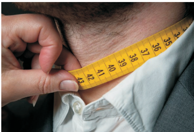
FIGURE 2. An accurate measurement for the male neck is found by measuring around the neck at the Adam's apple. The person measuring should be able to place two fingers behind the tape measure.