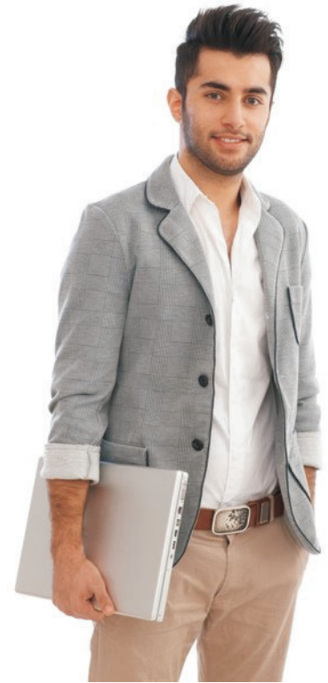
FIGURE 10. Business casual dress is tasteful and appropriate for the work environment. It is more relaxed than professional attire.