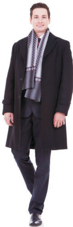
FIGURE 8. Tall men range from 6 feet 1 inch to 6 feet 3 inches tall, with a long torso and/or long arms. The coat sleeve and body length is 1½ inches longer than regular.