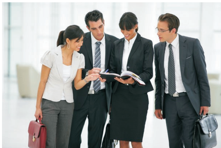
FIGURE 9. Professional attire is a conservative style of workplace dress required in most corporate offices.