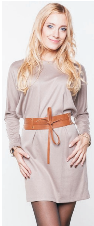
FIGURE 6. A belt defines the waist and helps shape the appearance of the hips for an inverted triangle silhouette.

An inverted triangle silhouette is the appearance of square shoulders wider than the body outline of the waist and hips; the waist and hips appear columnar (e.g., a pillar). Shoulder and bust/chest measurements are more than 5 percent larger than the hip measurement. For instance, a hip measurement of 36 inches and shoulder and bust/chest measurements of 45