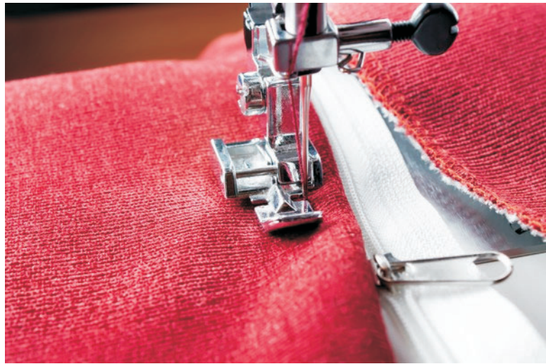
FIGURE 4. A zipper foot is an attachment for the sewing machine that can be adjusted to position it to the right or left side of the needle. What type of zipper application is shown here?