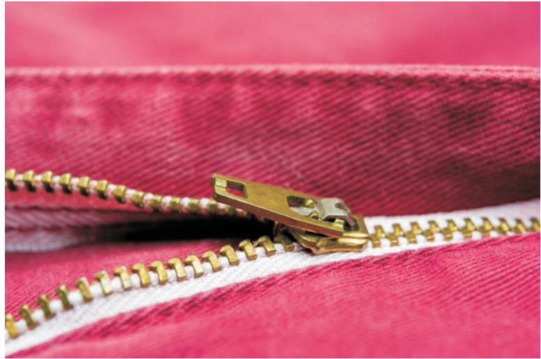
FIGURE 3. A lapped zipper is a fastener that uses a fold of fabric to cover the zipper itself from one side and is then topstitched across the bottom and up one side of the zipper. Lapped zippers are generally found in dress, skirt, and pant garments.