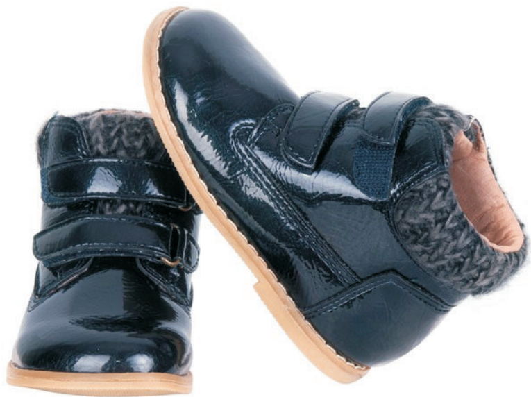
FIGURE 1. What is the advantage of using Velcro for these toddler boots rather than laces or hook and eye fasteners?

Zippers are fastening devices made of two rows of metal or plastic teeth held together by a sliding tab that makes the teeth fit together or come apart. They are the most often used form of fastening device. A poorly installed or ill-fitting zipper application can ruin the “look” of a garment. A variety of zipper applications exist for zipper insertion, each with a specific use and primary task. It is important to take into consideration the fabric being used and the finished look for a garment when deciding upon the proper zipper application. Zipper parts include the chain, teeth, slider, pull tab, tape, top stop, and bottom stop.