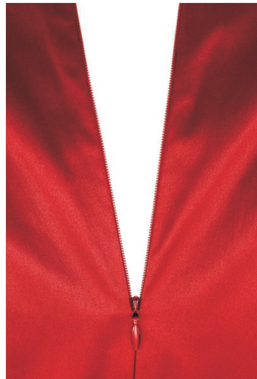
FIGURE 5. The tailor selected an invisible zipper application for this red satin dress fabric. What explains that choice?