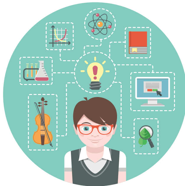
FIGURE 2. What are some of your interests?

Interests are things that a person likes to do. If you could do anything you wanted, what would you do? What are your hobbies? What do you like to do during your free time? The answers to these questions are your interests. Choosing a career that interests you will be much more satisfying than one that does not. Most people are more passionate, hardworking, and dedicated if they are interested in their work. Taking your interests into account will help you determine your ideal career path.