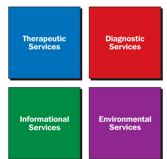
FIGURE 1. Review the four major health care services.

There are major health care service departments. Each of these departments is associated with its own major health care service.