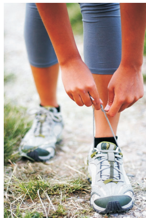
This shoe fits.