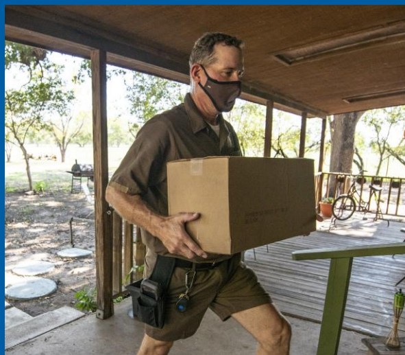
SFSP/SSO Meals To-Go: to-go or meal delivery in some rural areas