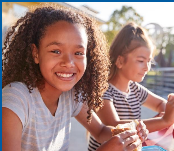
SFSP/SSO Meals: group onsite meals