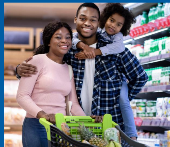
Summer EBT/SUN Bucks: grocery shopping benefits