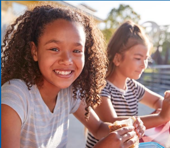
SFSP/SSO Meals: group onsite meals