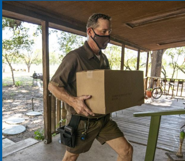
SFSP/SSO Meals To-Go: to-go or meal delivery in some rural areas