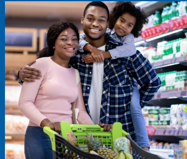
Summer EBT/SUN Bucks: grocery shopping benefits