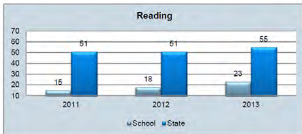
Figure 2.2 Percentage of All Students in the Meets/Exceeds Category for Reading PSAE

Reading scores were ahead of that for the State and informal data shows that this was the second largest in our SIG cohort. Female students performed much higher than male students in both SY 2012-13 and 2010-11.