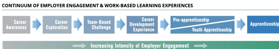
Figure 1 – The continuum of employer engagement and work-based learning. As intensity of employer engagement increases, student becomes more immersed in the workplace environment.

As you plan and implement your Work-Based Learning program, business and community partnerships will be a constant focus. All activities offered to students through a Work-Based Learning program are dependent on these partnerships. As learned in the previous module, the Work-Based Learning Continuum outlines varying and progressing levels of employer engagement.