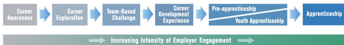
Figure 1 – The continuum of employer engagement and work-based learning. As intensity of employer engagement increases, student becomes more immersed in the workplace environment.