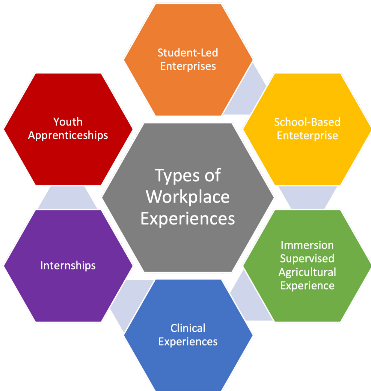
Figure 3 Types of Workplace Experiences