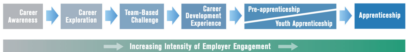
Figure 1 – The continuum of employer engagement and work-based learning. As intensity of employer engagement increases, student becomes more immersed in the workplace environment.

Work-based learning is defined in Perkins V legislation as “sustained interactions with industry or community professionals in real workplace settings, to the extent practicable, or simulated environments at an educational institution that foster in-depth, firsthand engagement with the tasks required in a given career field, that are aligned to curriculum and instruction.” It is an effective teaching strategy used to engage students in real-life, authentic occupational experiences. It incorporates structured, work-based learning activities into the curriculum, allowing a student to apply knowledge and skills learned in class and connect these learning experiences in the workplace (see Figure 2). Work-based learning provides students with the opportunity to engage and interact with industry experts (employers, postsecondary institutions), while learning to demonstrate essential employability and technical skills necessary for today's workforce.