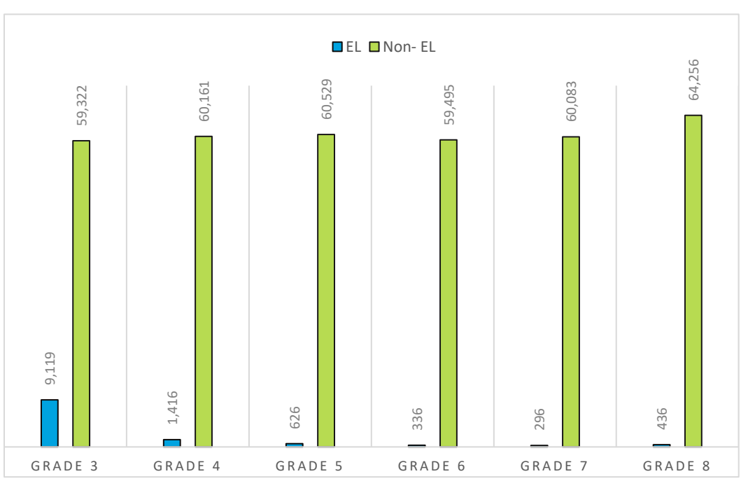
Chart 1 Students Meeting or Exceeding ELA Standards