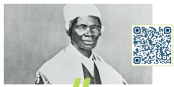
"The truth is powerful and will prevail."

Sojourner Truth, a former slave, became an advocate for abolition and civil and women's rights in the 19th century.