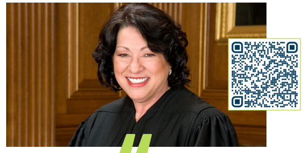
"Until we get equality in education, we won't have an equal society."

Justice Sotomayor, associate justice on the U.S. Supreme Court, was the first female Latina of Puerto Rican descent to serve on the U.S. Supreme Court.