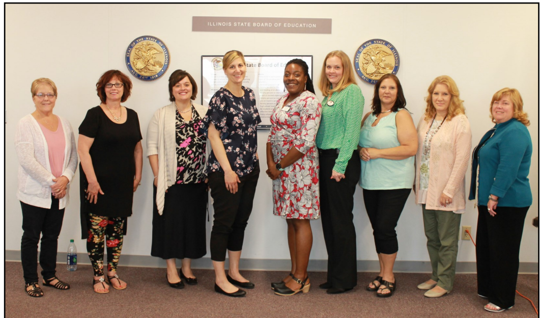
Members of the Illinois School Nutrition Advisory Council represent small, medium, and large districts, as well as self-operated and those with Food Service Management Contracts. The 16-member group includes food service directors, managers, administrators, a teacher, as well as individuals with advocacy groups and industry.

Feedback on topics will also be sought from all advisory board applicants via email.