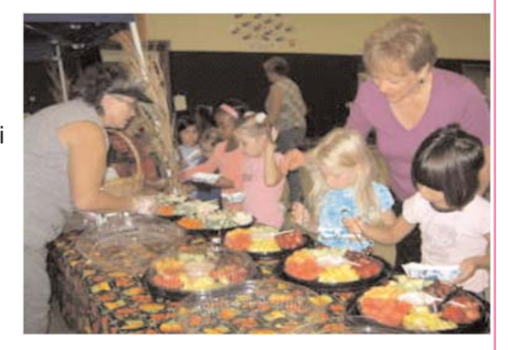
Montessori Magnet School in Rockford

Northwestern Elementary School in Palmyra