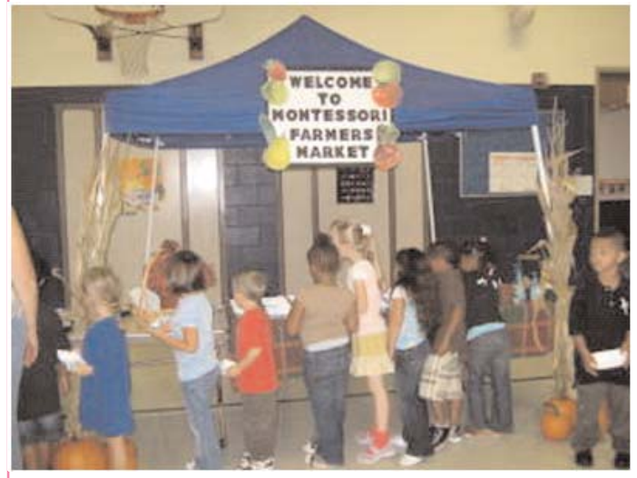
Rockford School District 205, Montessori Magnet School

The primary focus of the FFVP is to provide fresh produce to students. Nutrition education is critical to the program's success. As evidenced in the following scenarios, Illinois FFVP schools are taking advantage of the program using creative means to introduce new fresh fruits and vegetables, coupling that with nutrition education to maximize the program's intent. Hopefully, students make eating fresh fruits and vegetables a lifelong habit.