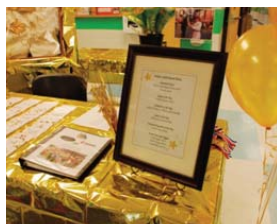
GOLVFIW HUSSC GOLD EVENT