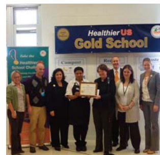
HUSSC RECIPIENT ACADEMY FOR GLOBAL CITIZENSHIP