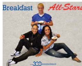
CUSD300 BREAKFAST CAMPAIGN