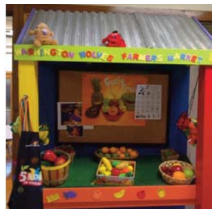
FFVP SCHOOL WASHINGTON ELEMENTARY QUINCY SD 72