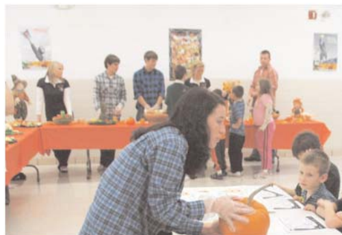
Northwestern Elementary School in Palmyra