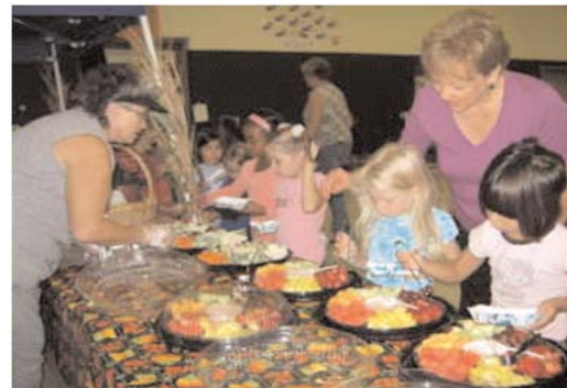
Montessori Magnet School in Rockford