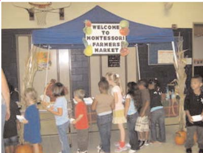
Rockford School District 205, Montessori Magnet School

The primary focus of the FFVP is to provide fresh produce to students. Nutrition education is critical to the program's success. As evidenced in the following scenarios, Illinois FFVP schools are taking advantage of the program using creative means to introduce new fresh fruits and vegetables, coupling that with nutrition education to maximize the program's intent. Hopefully, students make eating fresh fruits and vegetables a lifelong habit.