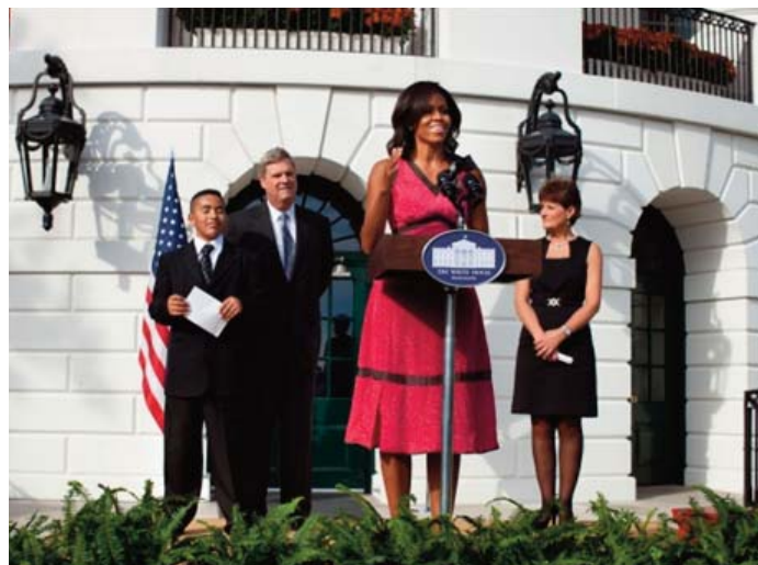
Agriculture Secretary Vilsack joins First Lady Michelle Obama to salute HealthierUS School Challenge Award Winners USDA blog .

Congratulations to each of the 71 Illinois HUSSC certified schools. Since the HUSSC Challenge inception in 2004, awards have been given to schools in 45 states. As of Oct. 20, 2011, there were 2161 schools certified, nationwide. To learn more about how your school can become HUSSC certified, visit www.fns.usda.gov/tn/healthierus/index.html .