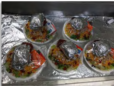
Momence High School, Momence, IL