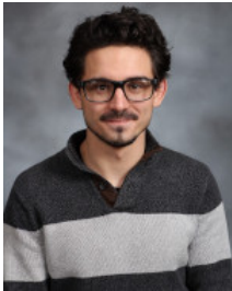
2023 Bilingual Teacher of the Year Normal Community High School, McLean County Unit School District 5