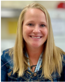
Special Education Teacher of the Year Forest View Educational Center, Township High School District 214

"I wanted to not only be a teacher of content, but also be a teacher of cultural power," he says. "Equity is my educational philosophy."