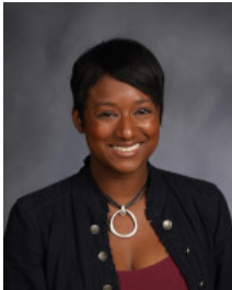
North Suburbs Regional Teacher of the Year Batavia High School, Batavia PSD 101

ISBE has announced the 2023 finalists for Illinois Teacher of the Year, as well as the 2023 Outstanding Early Career Educator. The annual Teacher of the Year program honors incredible classroom educators who have made lasting impacts on the students, families, and fellow educators in their school communities. ISBE will showcase several finalists in the Weekly Message each week leading up to the announcement of the 2023 Illinois Teacher of the Year. Congratulations to all this year’s extraordinary awardees!